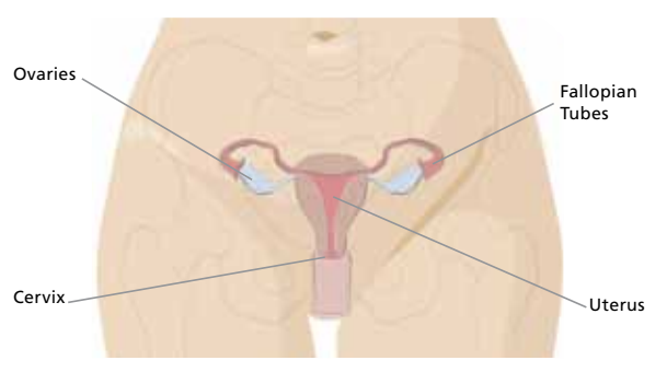
<sup>1</sup>Available from: http://womenshealth.gov/fag/hysterectomy.htm

Hysterectomy is the second most common surgical procedure for women in the United States, and an estimated one third of all U.S. women will have a hysterectomy by age 60.1