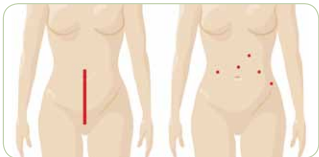
Open Surgery Incision

While hysterectomy is a relatively safe procedure, it may not be appropriate for all individuals or conditions. Always ask your doctor about all treatment options, as well as their risks and benefits.